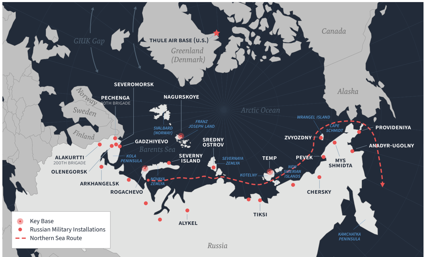
Figure 2: Russian Arctic Military Installations