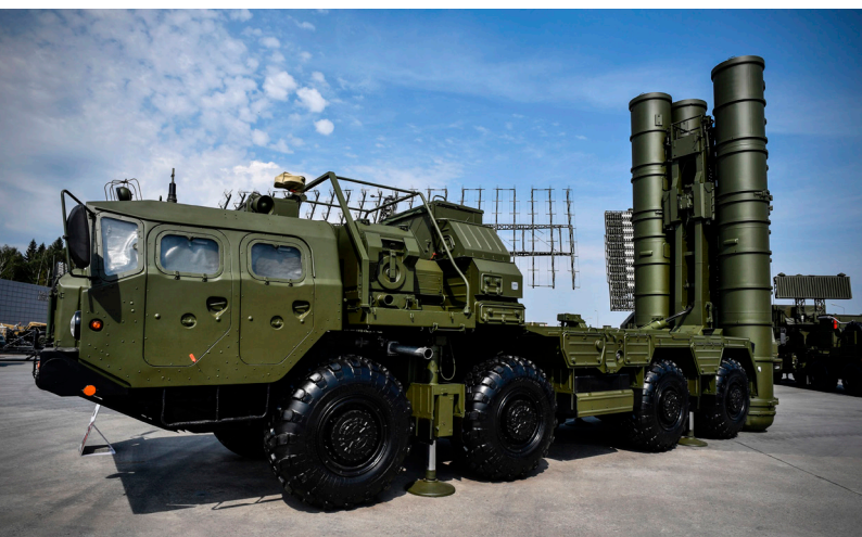
Russian S-400 anti-aircraft missile launching system is displayed at the exposition field in Kubinka Patriot Park outside Moscow on August 22, 2017.