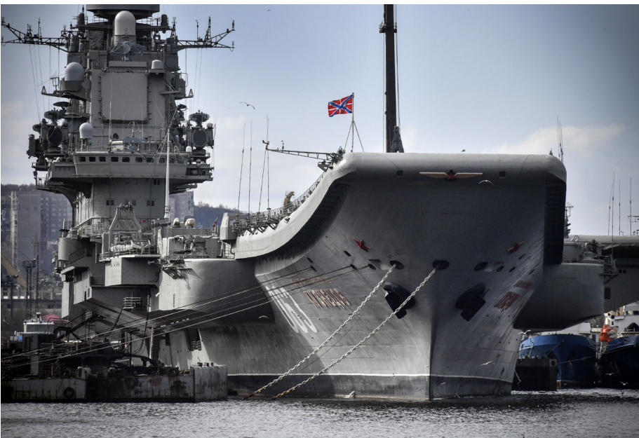
Russian aircraft carrier Admiral Kuznetsov tied up at a Rosatomflot moorage of the Russian northern port city of Murmansk on May 19, 2018.

• Ground Capabilities. Russia's major ground capabilities are limited in the Arctic. According