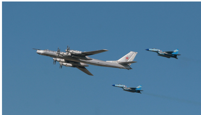
Russian strategic bomber TU-95 surrounded by MiG-29 flies over Monino airfield, some 40 kilometers from Moscow, during an air show marking the 95th anniversary of the foundation of the Russian air force on August 11, 2007.