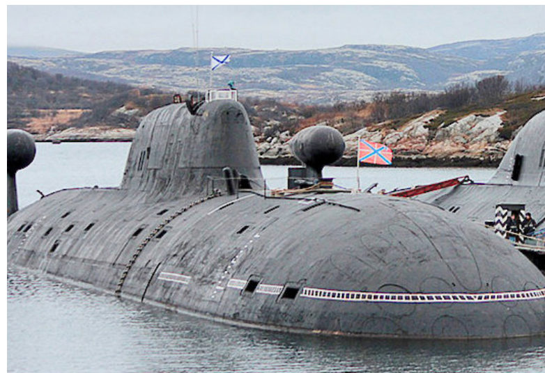
Russian Akula-class submarine K-335 Gepard.

The Northern Fleet also oversees the restoration of dozens of Soviet-era military installations that now dot the Russian Arctic, east of the Kola Peninsula. These installations vary in size and the degree to which they host troops and kinetic capabilities. Roughly, there are 3 major bases, 25 around 13 airfields, 10 radar stations, 20 border outposts, and 10 emergency rescue stations. 26 Finally, there are military assets that are not based in the Arctic but should be considered in the analysis. For example, two Russian airborne assault units are assigned to help protect