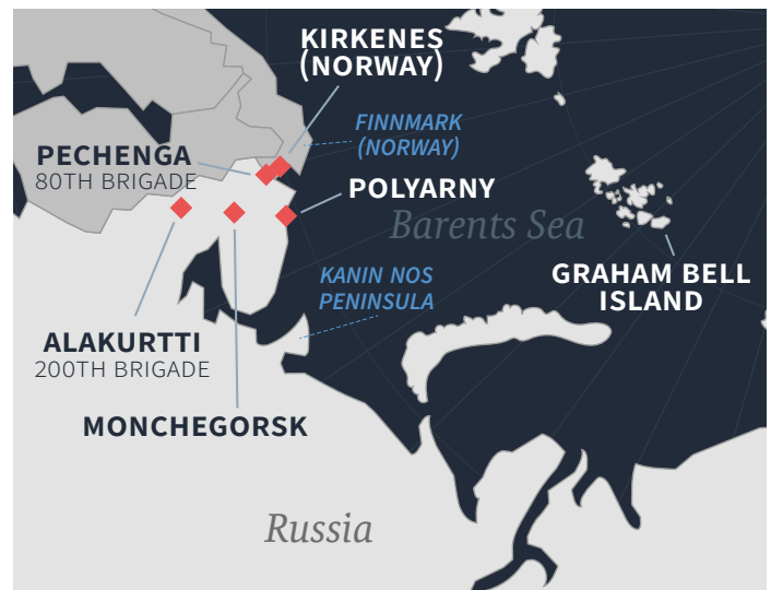
Figure 1: Spotlight on Northern Europe and Western Russian Arctic

Taking stock of these potential war damages, as well as the impact of sanctions on Russia’s defense industry, the third section assesses the relative attractiveness of hybrid tactics for Russia to assert itself in the Arctic. The fourth section analyzes some implications of these findings for NATO and the United States.